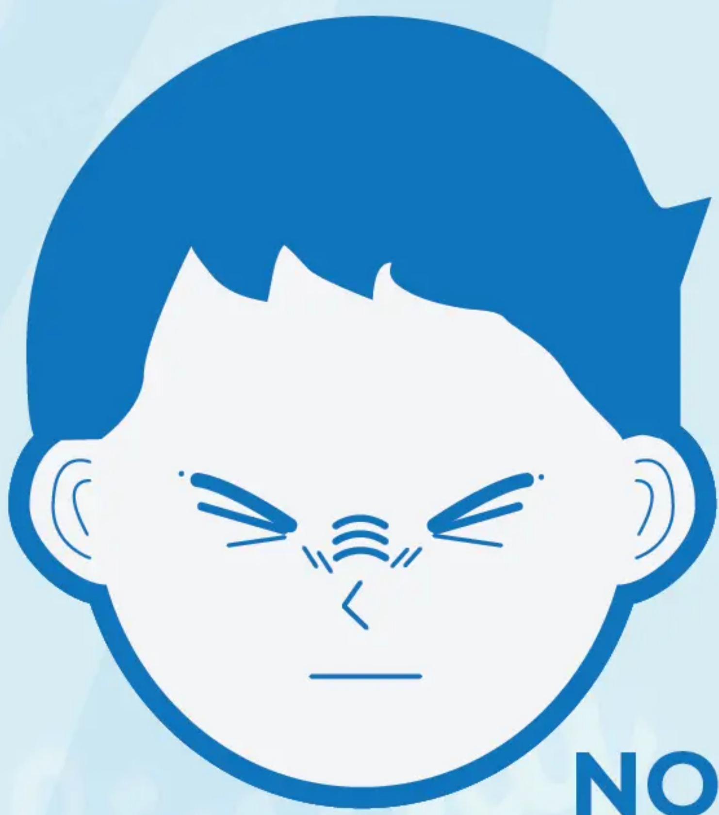
NOSE WRINKLING or EYE BLINKING